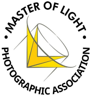
Photo Association for the promotion of photographers, the photographers' work and photo exhibitions. For authors who are absolutely free in the technique, style and execution of their expression.

Photo Association Master of Light has awarded patronage to the organizers of this International Exhibition of Photography. All acceptances in any section/theme are eligible for credits towards the distinction Master of Light.